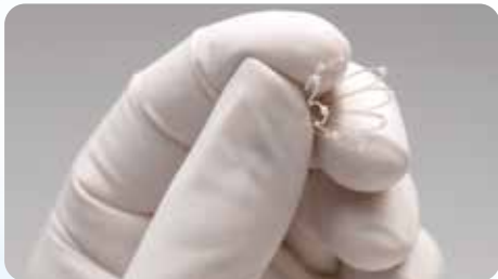
PROPEL sinus stent

Sinus surgery with PROPEL is clinically proven to provide relief by targeting inflammation , the primary characteristic of chronic sinusitis.